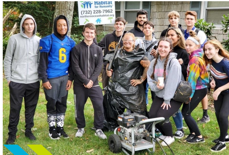
Manchester High School volunteers

Northern Ocean Habitat's partnership with 21 Plus and the ARC builds on relationships established with other social service agencies to maintain their group homes and revitalize their neighborhoods.