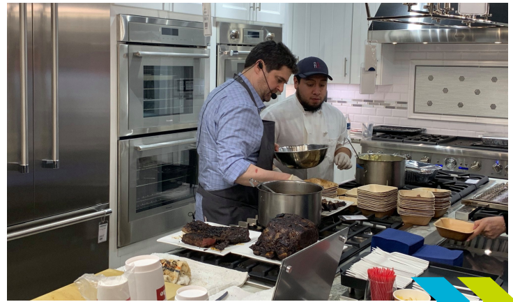
Celebrity chef live cooking demonstrations

The first Hearts for Habitat Celebrity Chef Event was on February 13, 2020 at Ferguson's Lakewood, NJ Showroom. All proceeds went directly toward Northern Ocean Habitat for Humanity. The event featured three nationally recognized chefs for an extraordinary evening with live cooking demonstrations in the working showroom kitchens, music, a silent auction, and raffle.