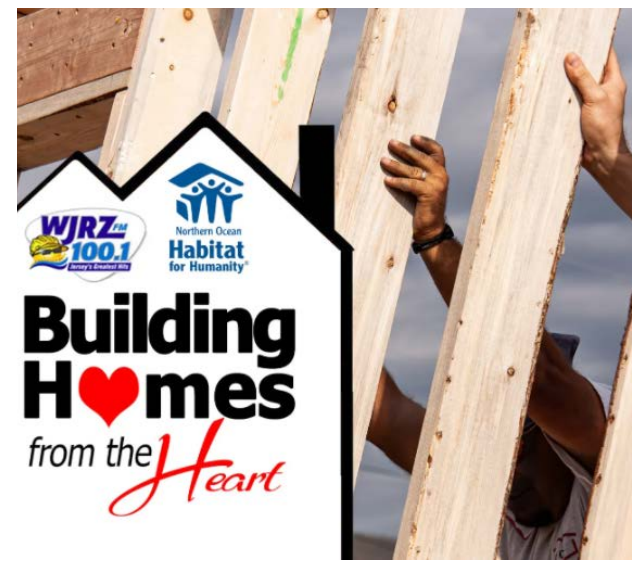
OCVTS, California Coolers, RWJ Barnabas, and Crossroads Realty all came out to help frame our 21st home!