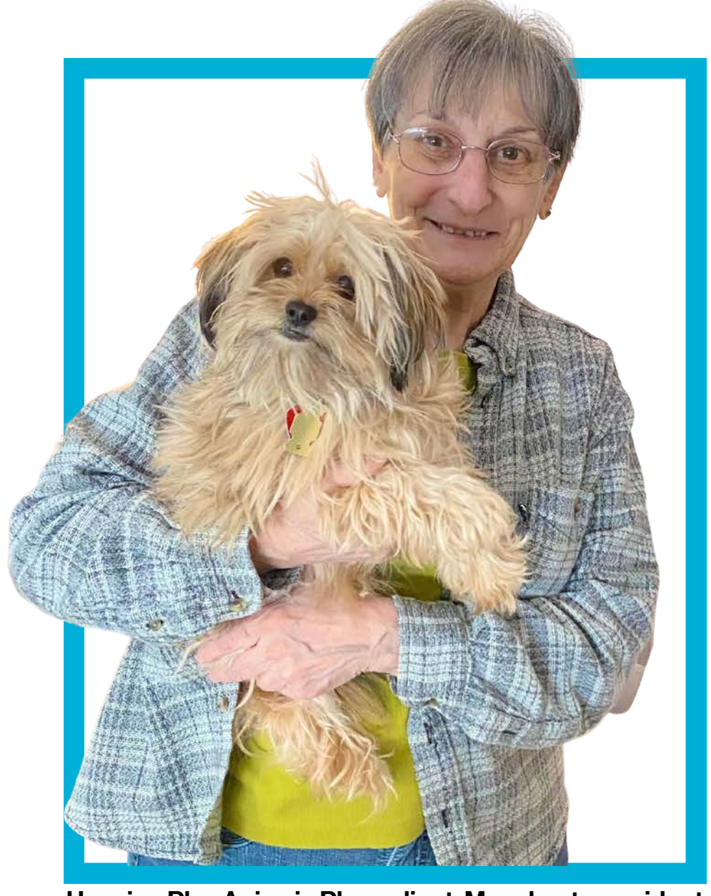
Housing Plus Aging in Place client, Manchester resident

Since its inception, our repair programs have provided ADA modifications and critical home repairs to homes in northern Ocean County.